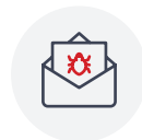
ACTIVE INTRUSIONS THAT BYPASSED TRADITIONAL MEASURES