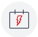
BRUTE FORCE ATTACKS