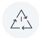
SERVICE EXPLOITS ATTEMPTS